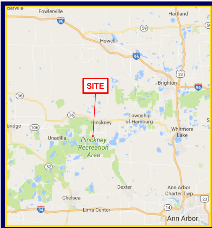
Beautiful 60 Acre Mostly Wooded Site On Silver Lake In Pinckney Recreational Area